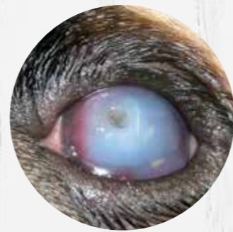
Deep corneal ulcer