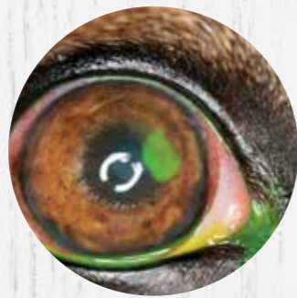
Shallow corneal ulcer